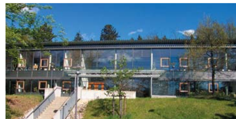
Headquarter and two of our aluminium pigment manufacturing sites

In view of their policy of continuous improvement, the company reserves the right to change the specification and design. Printed in Germany. CS 11/10